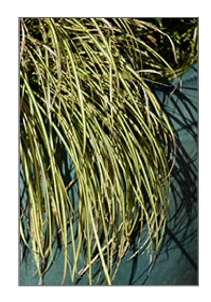
EverColor Eversheen Japanese Sedge foliage