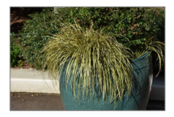
EverColor Eversheen Japanese Sedge

EverColor Eversheen Japanese Sedge is recommended for the following landscape applications;