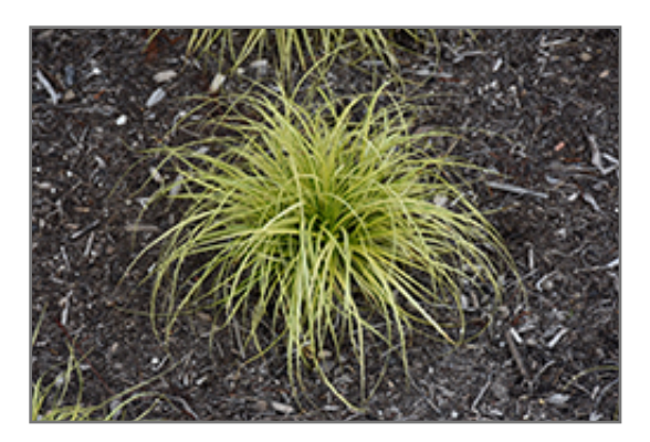
EverColor Eversheen Japanese Sedge

EverColor Eversheen Japanese Sedge will grow to be about 16 inches tall at maturity, with a spread of 16 inches. Its foliage tends to remain dense right to the ground, not requiring facer plants in front. It grows at a medium rate, and under ideal conditions can be expected to live for approximately 10 years. As an evegreen perennial, this plant will typically keep its form and foliage year-round.