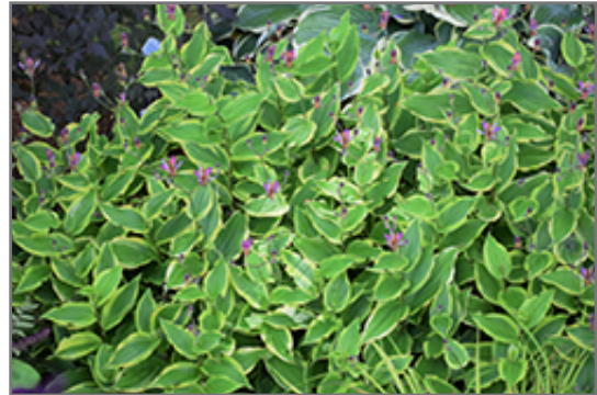
Autumn Glow Toad Lily in bloom