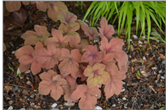
Pumpkin Spice Foamy Bells