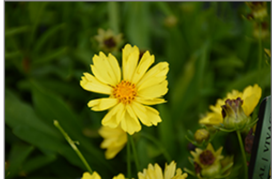
Leading Lady Sophia Tickseed flowers