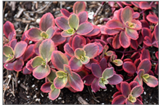
Sunsparkler Wildfire Stonecrop foliage