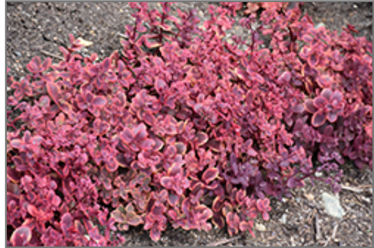
Sunsparkler Wildfire Stonecrop