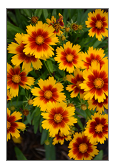
UpTick Gold and Bronze Tickseed flowers