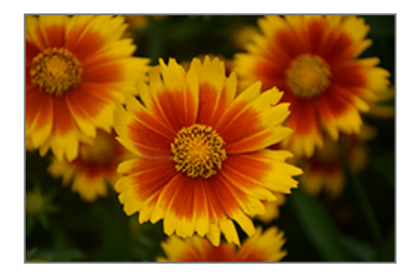
UpTick Gold and Bronze Tickseed flowers

UpTick Gold and Bronze Tickseed is recommended for the following landscape applications;