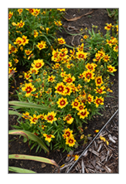
UpTick Gold and Bronze Tickseed in bloom

This plant should only be grown in full sunlight. It does best in average to evenly moist conditions, but will not tolerate standing water. It is not particular as to soil pH, but grows best in poor soils. It is somewhat tolerant of urban pollution. This particular variety is an interspecific hybrid. It can be propagated by division; however, as a cultivated variety, be aware that it may be subject to certain restrictions or prohibitions on propagation.