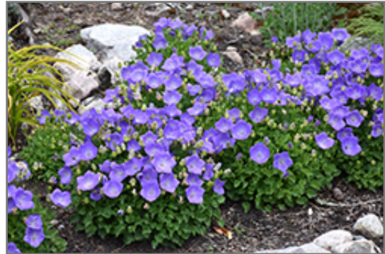
Rapido Blue Bellflower in bloom