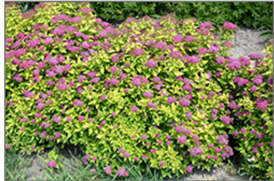
Double Play Gold Spirea in bloom