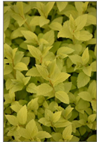
Double Play Gold Spirea foliage

This shrub should only be grown in full sunlight. It prefers to grow in average to moist conditions, and shouldn't be allowed to dry out. It is not particular as to soil type or pH. It is highly tolerant of urban pollution and will even thrive in inner city environments. This is a selected variety of a species not originally from North America.