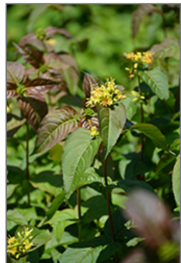
Kodiak Black Diervilla flowers