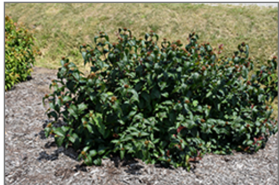
Kodiak Black Diervilla