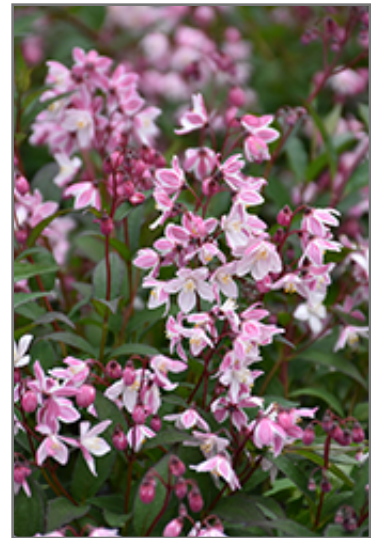
Yuki Cherry Blossom Deutzia flowers