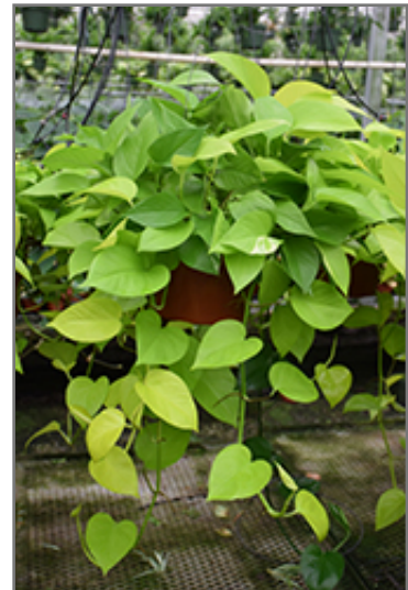
Neon Pothos in full

When grown indoors, Neon Pothos can be expected to grow to be about 5 feet tall at maturity, with a spread of 24 inches. It grows at a fast rate, and under ideal conditions can be expected to live for approximately 10 years. This houseplant performs well in both bright or indirect sunlight and strong artificial light, and can therefore be situated in almost any well-lit room or location. It does best in average to evenly moist soil, but will not tolerate standing water. The surface of the soil shouldn't be allowed to dry out completely, and so you should expect to water this plant once and possibly even twice each week. Be aware that your particular watering schedule may vary depending on its location in the room, the pot size, plant size and other conditions; if in doubt, ask one of our experts in the store for advice. It is not particular as to soil type or pH; an average potting soil should work just fine. Be warned that parts of this plant are known to be toxic to humans and animals, so special care should be exercised if growing it around children and pets.