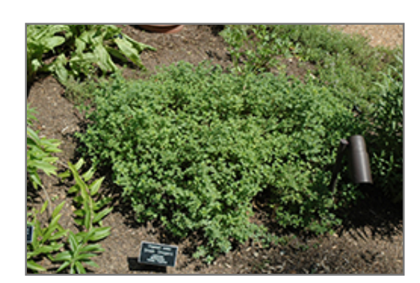
Greek Oregano