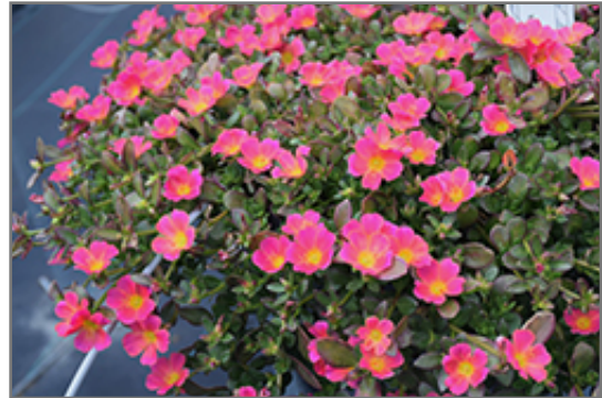
Mojave Pink Portulaca flowers