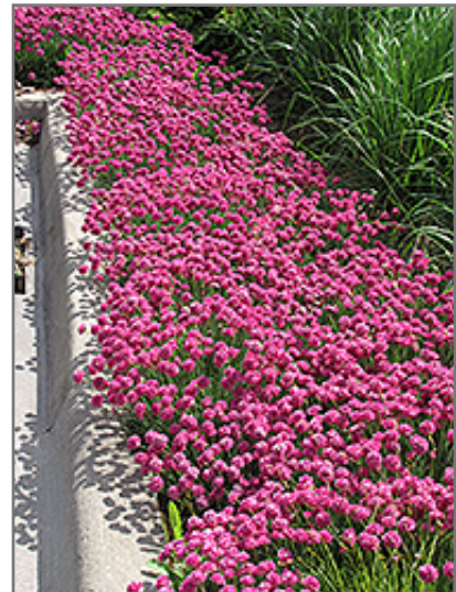
Dusseldorf Pride Sea Thrift in bloom

Dusseldorf Pride Sea Thrift is recommended for the following landscape applications;