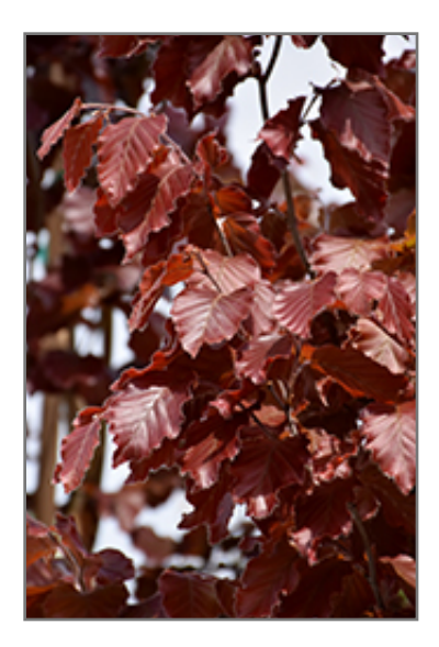
Red Obelisk Beech foliage