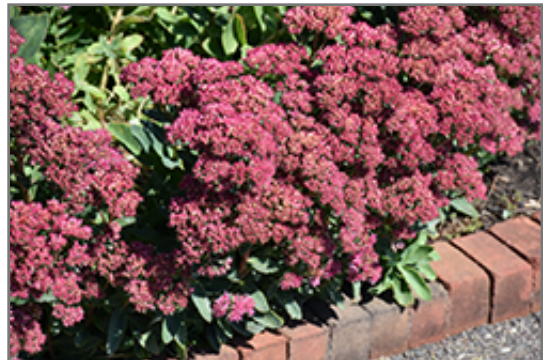
Carl Stonecrop in bloom

This is a relatively low maintenance plant, and is best cleaned up in early spring before it resumes active growth for the season. It is a good choice for attracting bees and butterflies to your yard, but is not particularly attractive to deer who tend to leave it alone in favor of tastier treats. It has no significant negative characteristics.