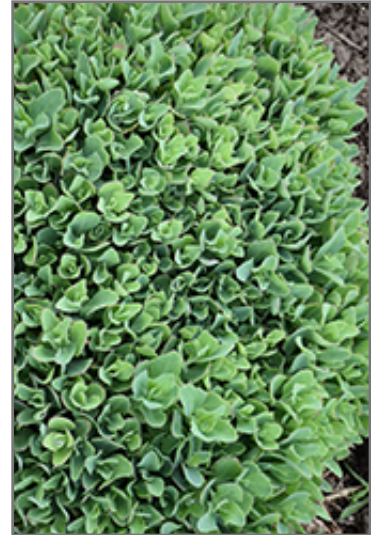
Carl Stonecrop foliage

Carl Stonecrop will grow to be about 16 inches tall at maturity, with a spread of 24 inches. When grown in masses or used as a bedding plant, individual plants should be spaced approximately 18 inches apart. Its foliage tends to remain dense right to the ground, not requiring facer plants in front. It grows at a fast rate, and under ideal conditions can be expected to live for approximately 15 years. As an herbaceous perennial, this plant will usually die back to the crown each winter, and will regrow from the base each spring. Be careful not to disturb the crown in late winter when it may not be readily seen!