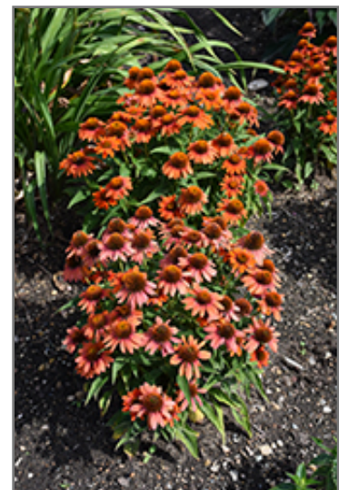
Sombrero Adobe Orange Coneflower in bloom