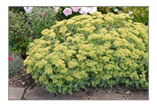
Rock 'N Grow Lemonjade Stonecrop in bloom

This is a relatively low maintenance plant, and is best cleaned up in early spring before it resumes active growth for the season. It is a good choice for attracting bees and butterflies to your yard, but is not particularly attractive to deer who tend to leave it alone in favor of tastier treats. It has no significant negative characteristics.