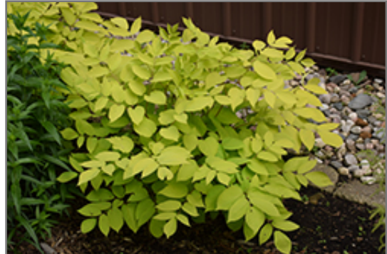
Sun King Japanese Spikenard