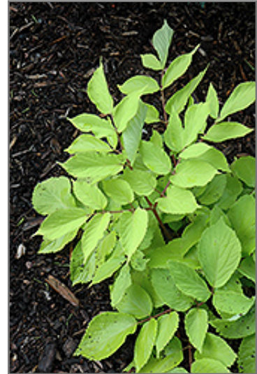
Sun King Japanese Spikenard foliage

This plant performs well in both full sun and full shade. It prefers to grow in average to moist conditions, and shouldn't be allowed to dry out. It is not particular as to soil type or pH. It is highly tolerant of urban pollution and will even thrive in inner city environments. This is a selected variety of a species not originally from North America.