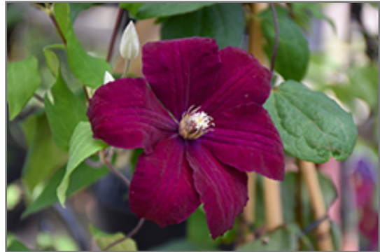
Rouge Cardinal Clematis flowers