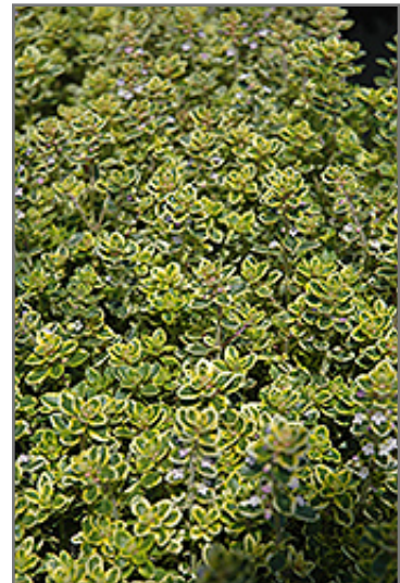
Lemon Thyme foliage

Lemon Thyme is smothered in stunning spikes of lilac purple flowers rising above the foliage from early to late summer. Its attractive tiny fragrant round leaves remain light green in color throughout the year.