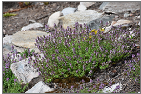
Lemon Thyme in bloom

This plant is quite ornamental as well as edible, and is as much at home in a landscape or flower garden as it is in a designated herb garden. It should only be grown in full sunlight. It prefers to grow in average to dry locations, and dislikes excessive moisture. It is considered to be drought-tolerant, and thus makes an ideal choice for a low-water garden or xeriscape application. It is not particular as to soil type or pH. It is highly tolerant of urban pollution and will even thrive in inner city environments. Consider covering it with a thick layer of mulch in winter to protect it in exposed locations or colder microclimates. This particular variety is an interspecific hybrid. It can be propagated by division; however, as a cultivated variety, be aware that it may be subject to certain restrictions or prohibitions on propagation.