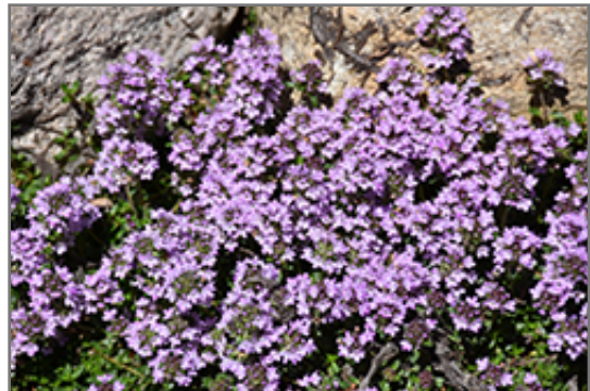
Purple Carpet Creeping Thyme flowers