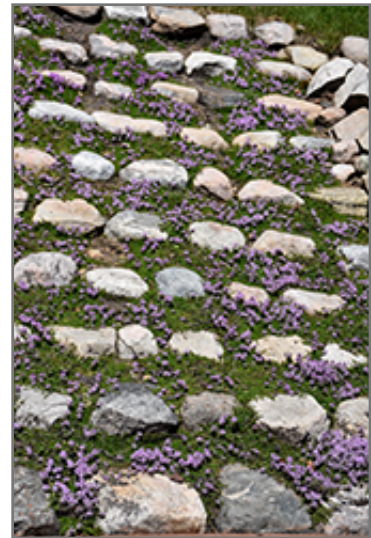
Purple Carpet Creeping Thyme in bloom

Purple Carpet Creeping Thyme will grow to be only 2 inches tall at maturity extending to 3 inches tall with the flowers, with a spread of 18 inches. When grown in masses or used as a bedding plant, individual plants should be spaced approximately 16 inches apart. Its foliage tends to remain low and dense right to the ground. It grows at a fast rate, and under ideal conditions can be expected to live for approximately 10 years. As an evergreen perennial, this plant will typically keep its form and foliage year-round.