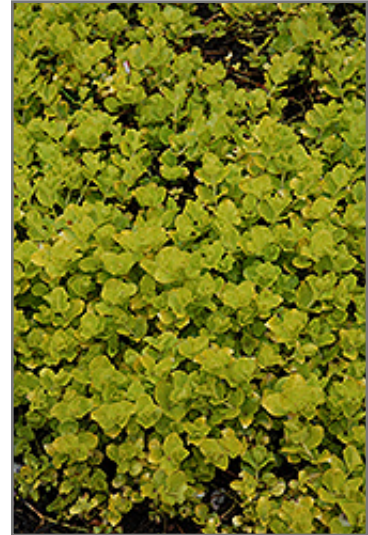
Golden Creeping Jenny foliage

Golden Creeping Jenny is recommended for the following landscape applications;