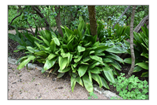
Cast Iron Plant