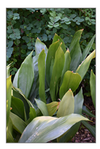
Cast Iron Plant foliage