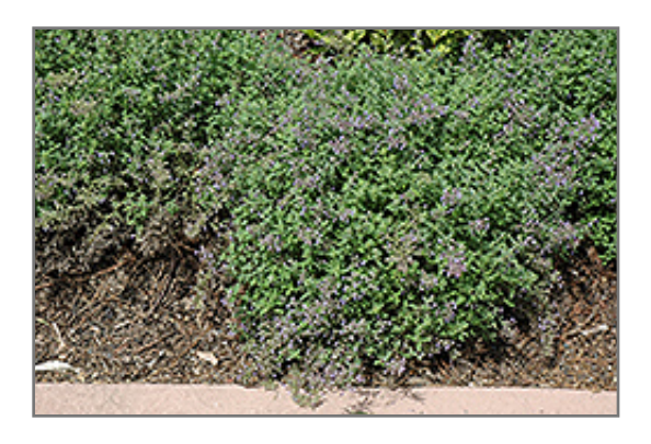
Junior Walker Catmint in bloom