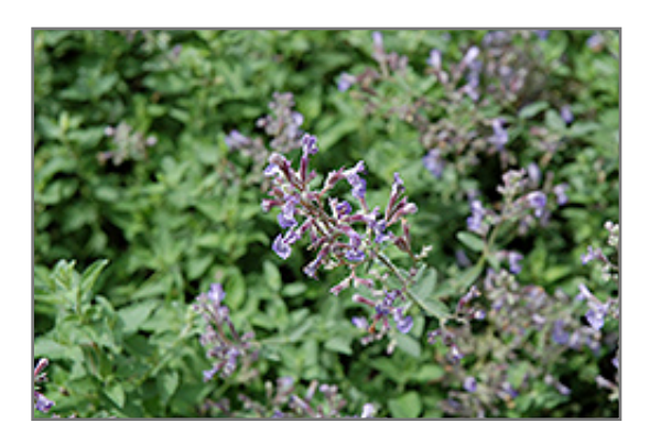
Junior Walker Catmint flowers