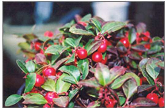
Creeping Wintergreen fruit

Creeping Wintergreen is recommended for the following landscape applications;