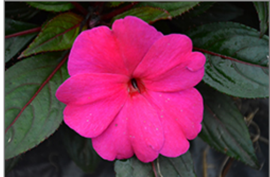
Magnum Blue New Guinea Impatiens flowers

Magnum Blue New Guinea Impatiens is recommended for the following landscape applications;