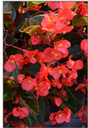
Big Red Bronze Leaf Begonia flowers

Big Red Bronze Leaf Begonia is a fine choice for the garden, but it is also a good selection for planting in outdoor containers and hanging baskets. It is often used as a 'filler' in the 'spiller-thriller-filler' container combination, providing a mass of flowers and foliage against which the larger thriller plants stand out. Note that when growing plants in outdoor containers and baskets, they may require more frequent waterings than they would in the yard or garden.