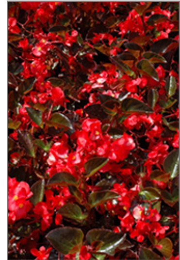
Big Red Bronze Leaf Begonia flowers