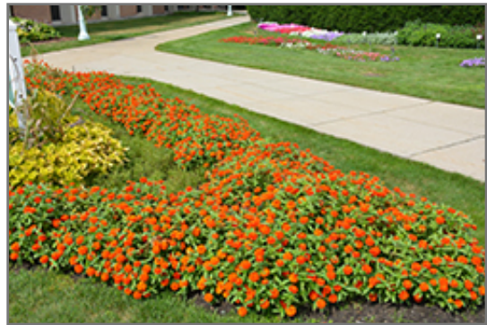
Profusion Double Fire Zinnia in bloom

Profusion Double Fire Zinnia is a fine choice for the garden, but it is also a good selection for planting in outdoor containers and hanging baskets. It is often used as a 'filler' in the 'spiller-thriller-filler' container combination, providing a mass of flowers against which the larger thriller plants stand out. Note that when growing plants in outdoor containers and baskets, they may require more frequent waterings than they would in the yard or garden.