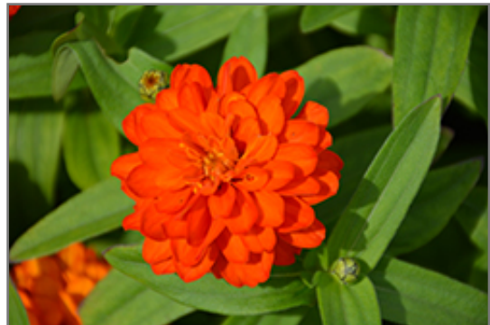
Profusion Double Fire Zinnia flowers