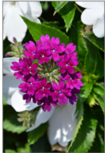
Superbena Royale Plum Wine Verbena flowers