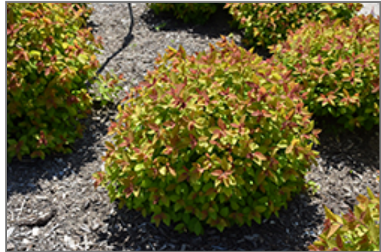
Double Play Big Bang Spirea