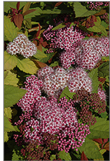
Double Play Big Bang Spirea flowers

Double Play Big Bang Spirea is recommended for the following landscape applications;