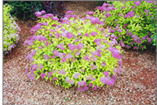
Goldmound Spirea in bloom

This shrub should only be grown in full sunlight. It prefers to grow in average to moist conditions, and shouldn't be allowed to dry out. It is not particular as to soil type or pH. It is highly tolerant of urban pollution and will even thrive in inner city environments. This is a selected variety of a species not originally from North America.