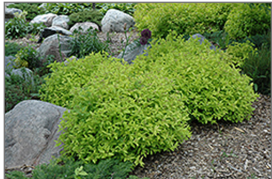
Goldmound Spirea