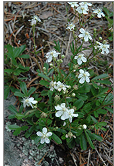
Three Toothed Potentilla flowers