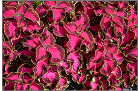
Chocolate Covered Cherry Coleus foliage

Chocolate Covered Cherry Coleus is a fine choice for the garden, but it is also a good selection for planting in outdoor containers and hanging baskets. It is often used as a 'filler' in the 'spiller-thriller-filler' container combination, providing a canvas of foliage against which the larger thriller plants stand out. Note that when growing plants in outdoor containers and baskets, they may require more frequent waterings than they would in the yard or garden.