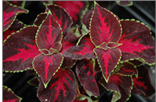
Chocolate Covered Cherry Coleus foliage