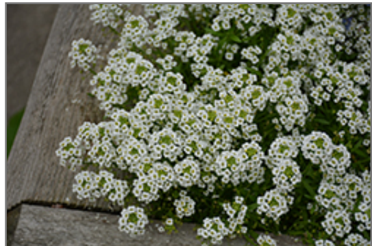
Snow Princess Alyssum flowers

Snow Princess Alyssum is recommended for the following landscape applications;