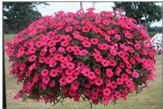
Supertunia Vista Fuchsia Petunia in bloom