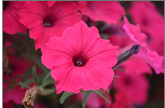
Supertunia Vista Fuchsia Petunia flowers