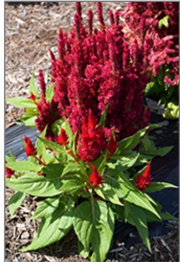
Fresh Look Red Celosia in bloom