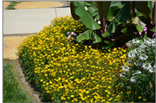
Goldilocks Rocks Bidens in bloom