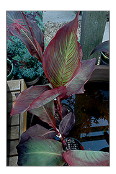
Black Knight Canna foliage