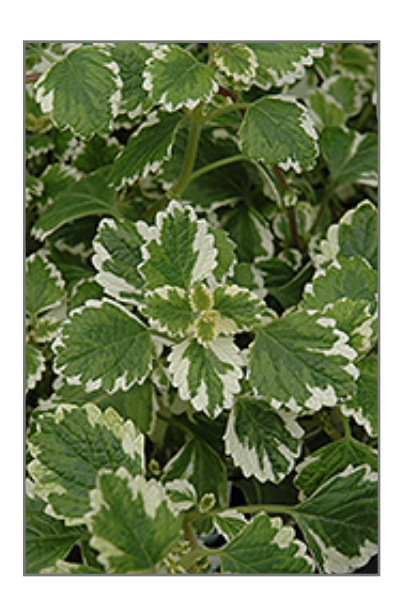
Variegated Swedish Ivy foliage

Variegated Swedish Ivy will grow to be about 8 inches tall at maturity, with a spread of 18 inches. When grown in masses or used as a bedding plant, individual plants should be spaced approximately 15 inches apart. Its foliage tends to remain low and dense right to the ground. Although it's not a true annual, this plant can be expected to behave as an annual in our climate if left outdoors over the winter, usually needing replacement the following year. As such, gardeners should take into consideration that it will perform differently than it would in its native habitat.