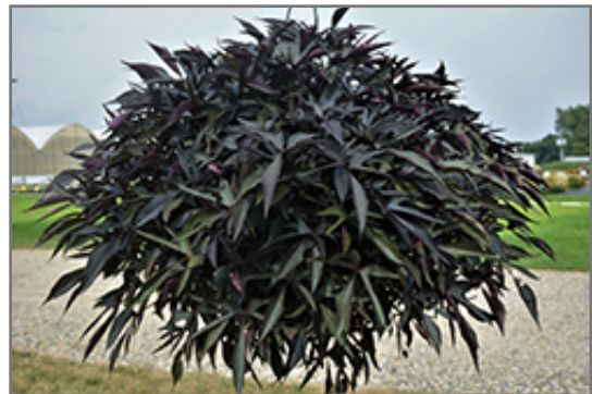
Illusion Midnight Lace Sweet Potato Vine