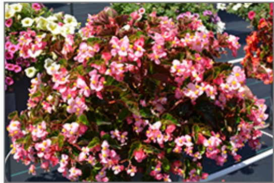
BabyWing Pink Begonia in bloom

BabyWing Pink Begonia is a fine choice for the garden, but it is also a good selection for planting in outdoor containers and hanging baskets. It is often used as a 'filler' in the 'spiller-thriller-filler' container combination, providing a mass of flowers and foliage against which the thriller plants stand out. Note that when growing plants in outdoor containers and baskets, they may require more frequent waterings than they would in the yard or garden.