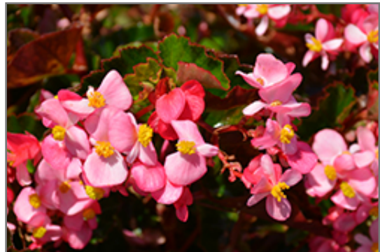
BabyWing Pink Begonia flowers