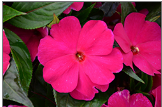
Magnum Purple New Guinea Impatiens flowers