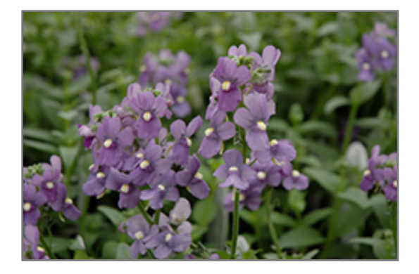
Bluebird Nemesia flowers