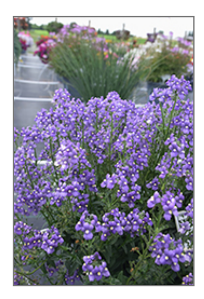
Bluebird Nemesia flowers