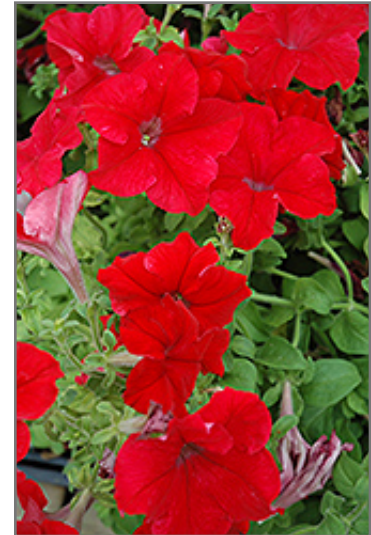
Dreams Red Petunia flowers