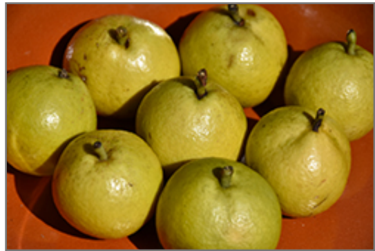
Golden Spice Pear fruit