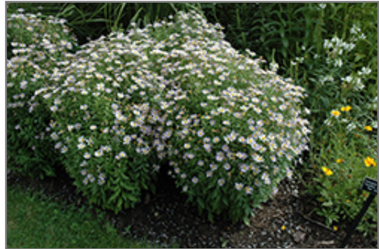
Blue Star Japanese Aster in bloom