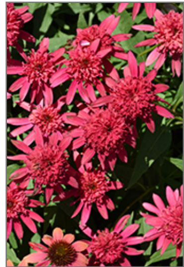
Double Scoop Raspberry Coneflower flowers