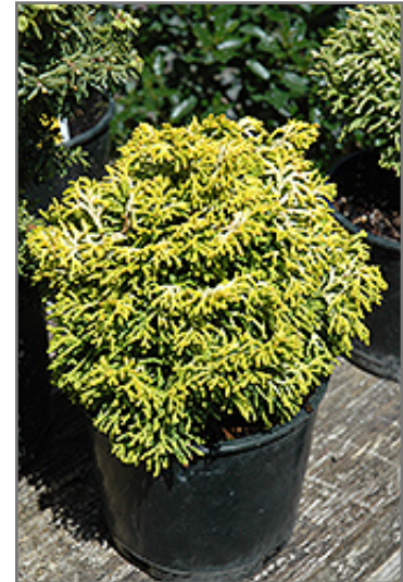
Butterball Hinoki Falsecypress