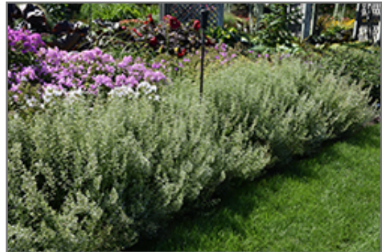
Montrose White Dwarf Calamint in bloom